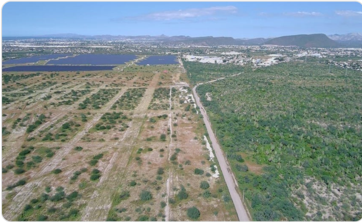
Parques de Olas Altas Proximidad