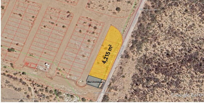
Storage Parques de Olas Altas La Paz, BCS