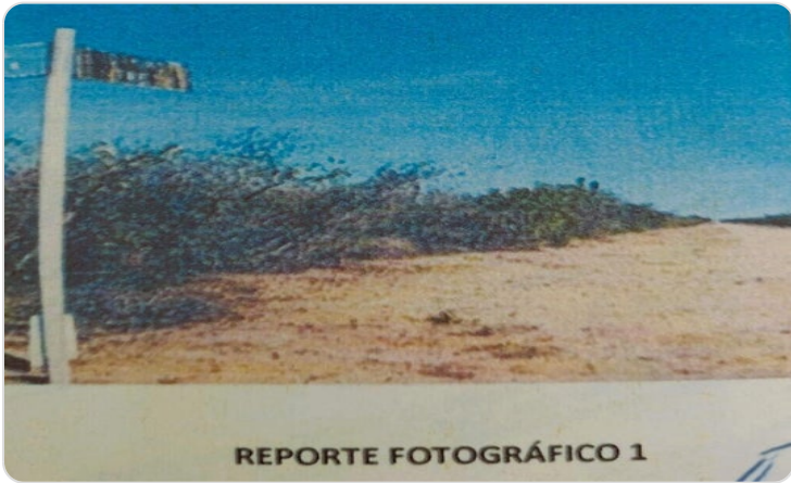
REPORTE FOTOGRAFICO 1