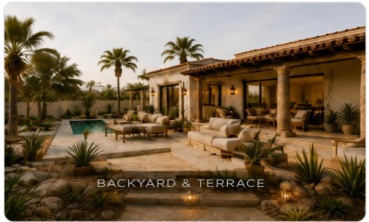
BACKYARD & TERRACE