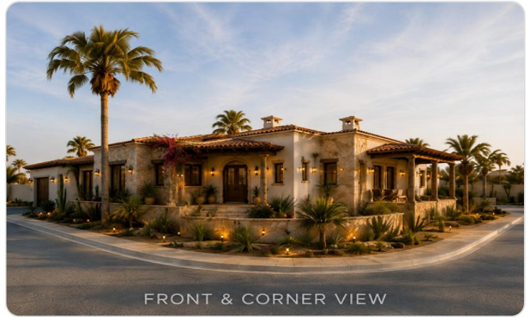
FRONT & CORNER VIEW