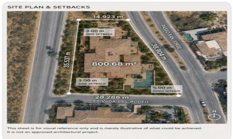
SITE PLAN & SETBACKS

This sheet is for visual reference only and is merely illustrative of what could be achieved. It is not an approved architectural project.