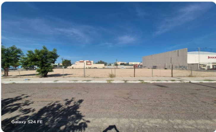
Galaxy S24 FE