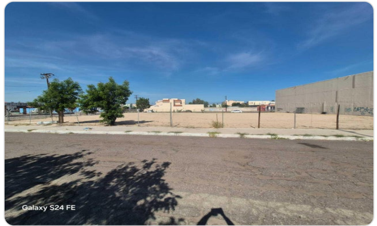
Galaxy S24 FE