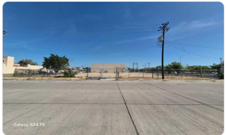
Galaxy S24 FE