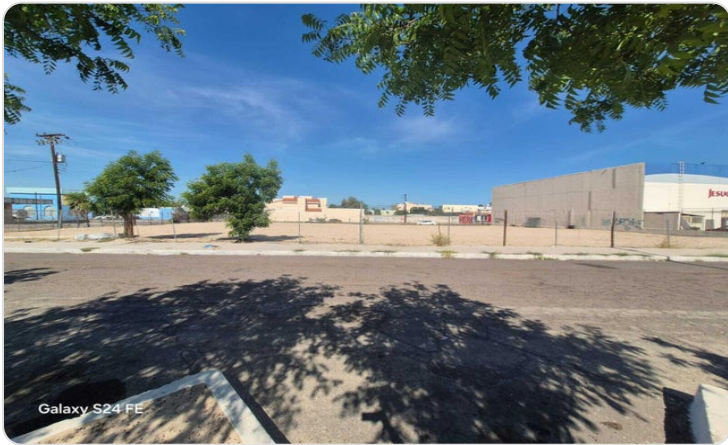
Galaxy S24 FE