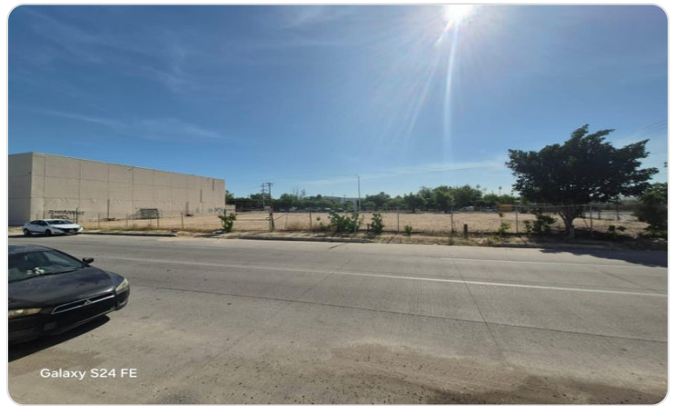
Galaxy S24 FE