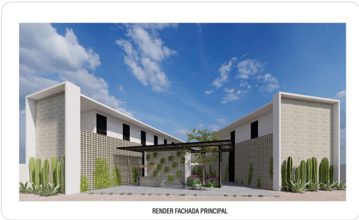
RENDER FACHADA PRINCIPAL